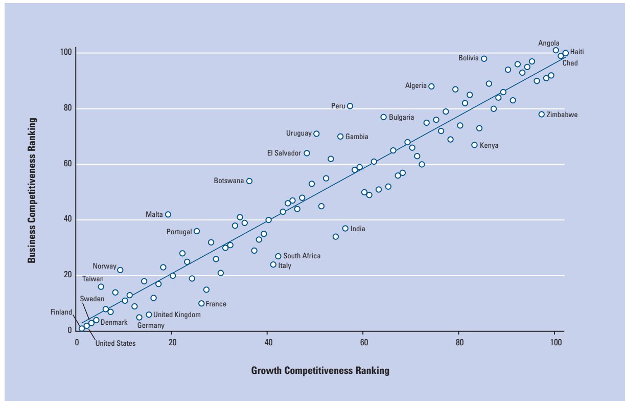
Figure 1: Growth and Business Competitiveness rankings

continues to grow. Many policymakers have judged that at some point there would have to be a downward adjustment in the value of the dollar and in the current account deficit. This past year that adjustment seems to have started, with a substantial swing in the euro/dollar exchange rate. A particular concern now is to figure out how the world economy can return to sustainable growth while adjusting to a still lower dollar and lower US deficit, when these occur. The adjustment process must be seen in a global context, not just in a US context.